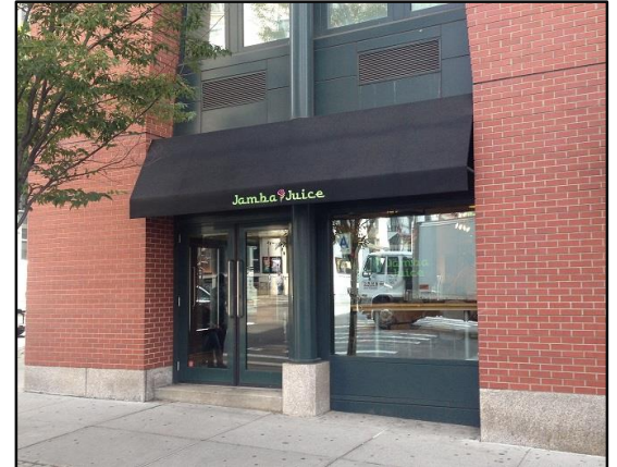
View from Houston St