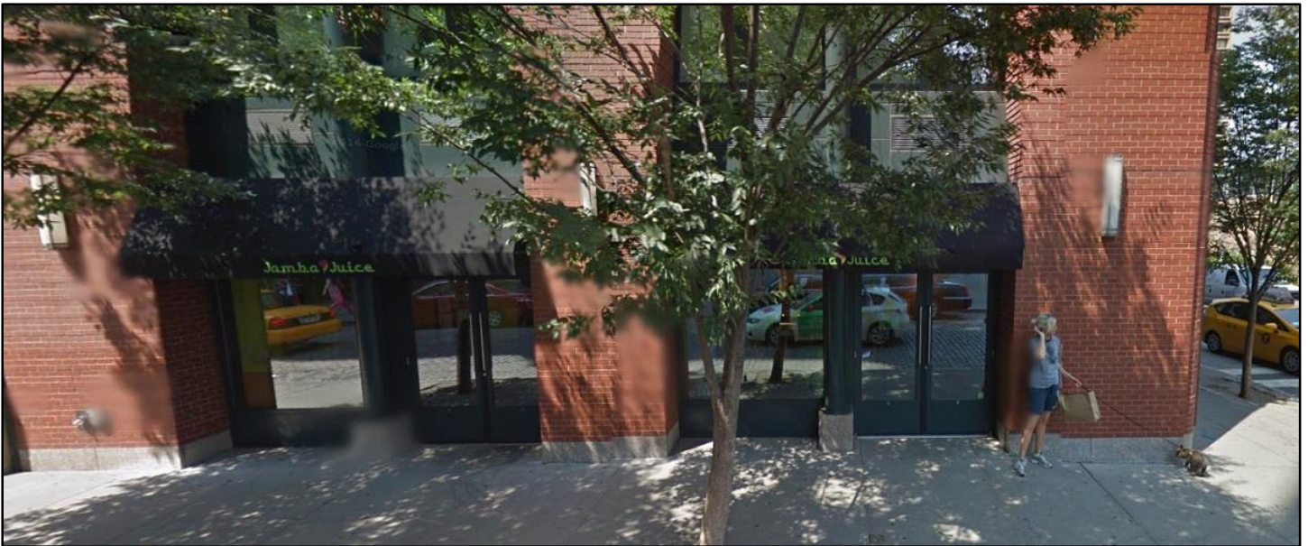
View From Mercer St.

For More Information Contact Exclusive Agents: