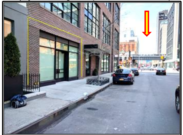
Steps from the High Line (7.6mm annual visitors)