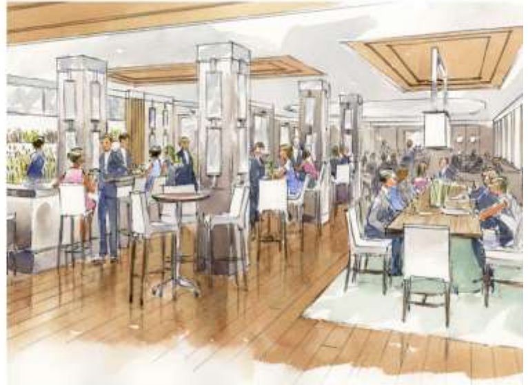
Proposed Restaurant concept

Ground Level ~ 4000 square feet* *divisible to ~2,500 sf Lower Level ~2000 square feet Frontage ~ 33 feet Ideal Uses All Uses Considered Formerly Turkuaz Restaurant Rent Realistic! On request Possession Immediate Features Prime Broadway Corner Neighbors Metro Diner, Mattress Firm Walgreens, West Side Market